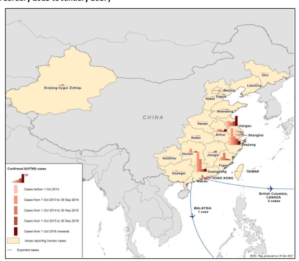
Figure 2. Distribution of laboratory-confirmed human cases of H7N9 by place of reporting and wave (February 2013 to January 2017)